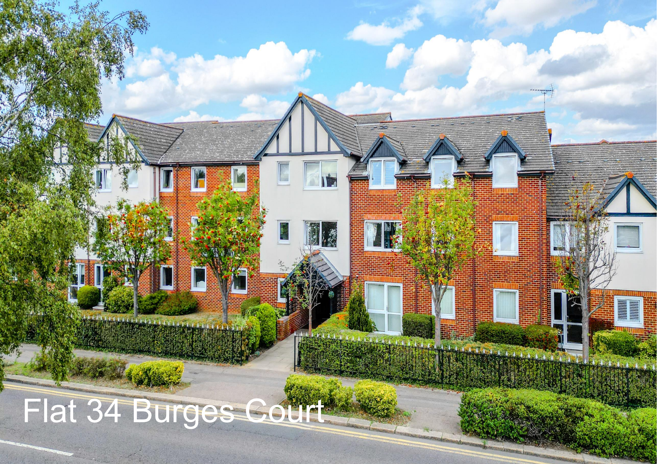
Flat 34 Burges Court